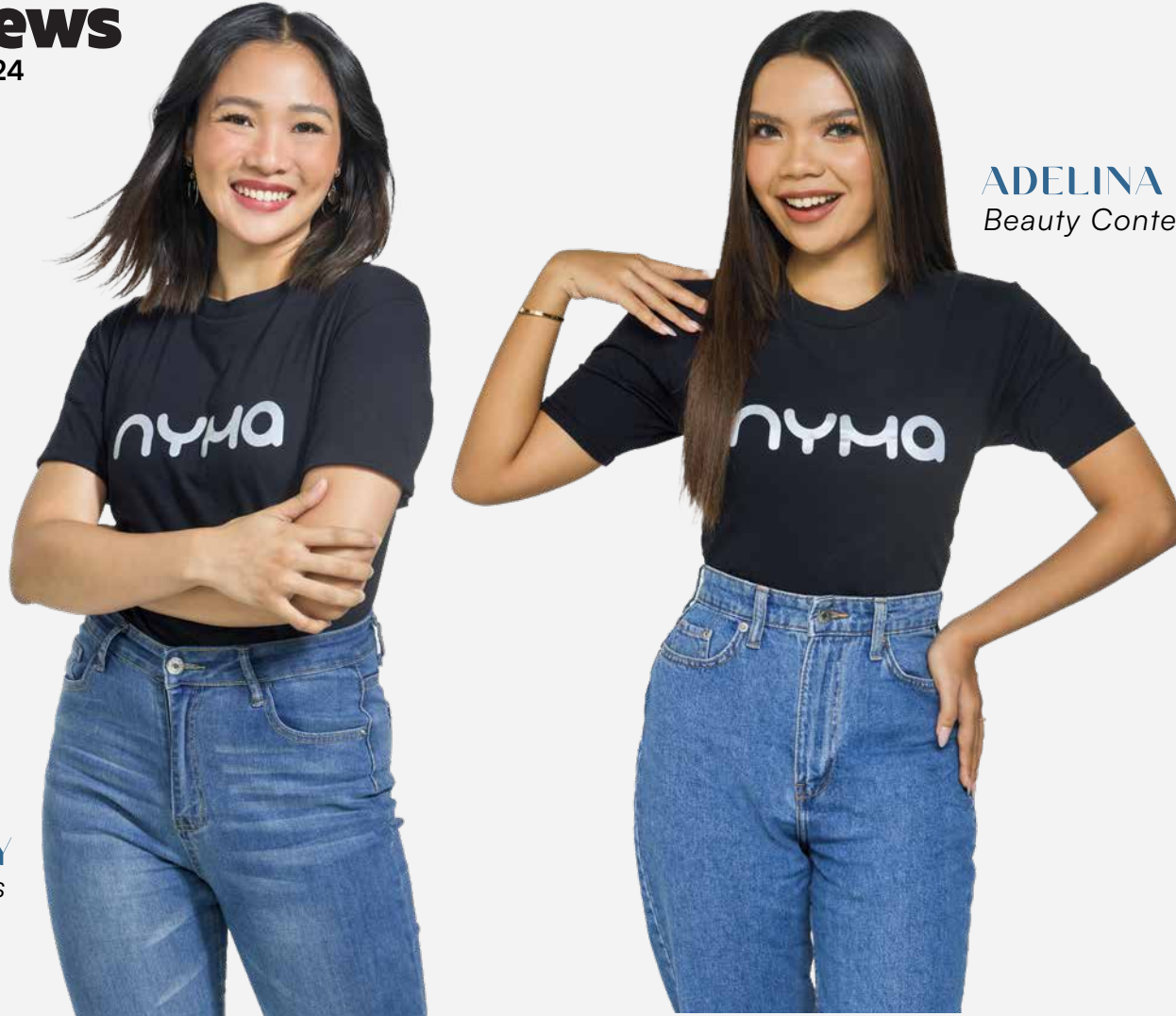
PAT TINGJUY Actress